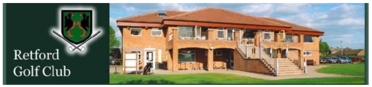
Communications Group (On behalf of the Management Committee and Club Members)